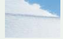
Non woven tissue 38 gr/m2 app. 120 x 160 mm