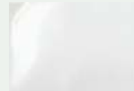
c: Shiny couche paper (mostly used)