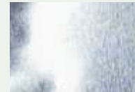
d: Silver PET