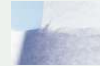
Cellulose paper 40 gr/m2 app. 120 x 205 mm