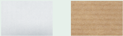
a: Mat white kraft paper b: Mat brown kraft paper